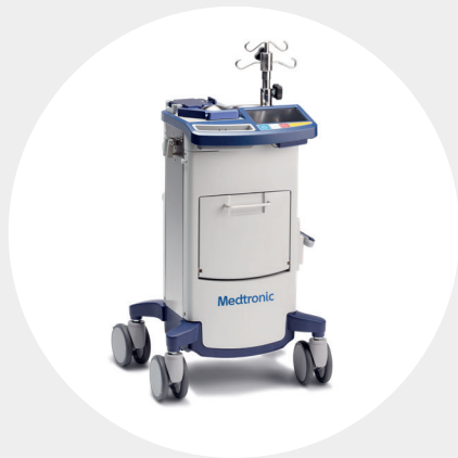
autoLog IQ™ Autotransfusion System