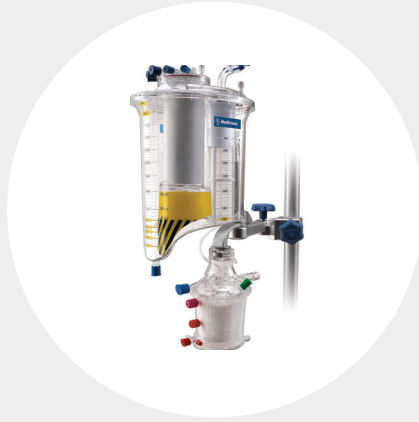
Affinity Fusion™ Oxygenation System